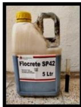
FIGURE 1. - Flo-crete SP-42 (5 liters)