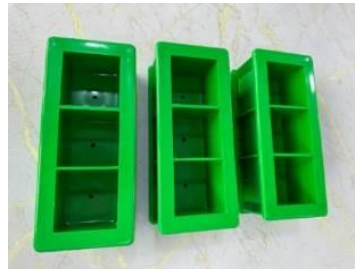
FIGURE 2. - Cubes of mortar

Molds used and Specimens: Plastic Cubes were prepared to be applied for mortar tests. 9 cubes of 50x50x50mm were prepared as shown in figure (2).