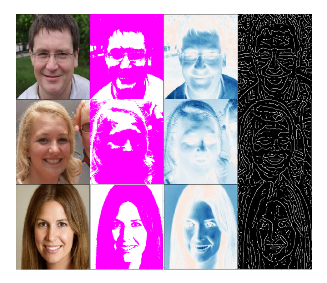
FIGURE 5. - results of a preprocessing sample image from "140k Real and Fake Faces"