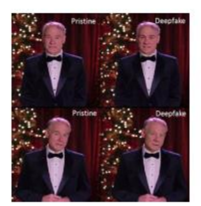
FIGURE 1. - deepfake face images of Ian McKellen Tommy and Lee Jones [6]

In the traditional technique to image forgery detection, there are two categories: