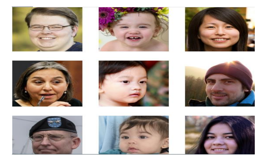
FIGURE 3. - excerpts of the real images dataset

Binary classifiers are widely used by deepfake detection systems to categorize information into (fake and real) classes. To train the classification models in this strategy, a significant quantity of real and fake high-quality data is required. Dataset obtained from the Kaggle website. This dataset comprises of all (70k real) faces out from "Flickr" dataset collected by "Nvidia". Also, (70k fake) faces were chosen from "Bojan's 1 Million" fake faces (A product made with StyleGAN). In this dataset, both datasets were combined, all of the images were scaled to 256 pixels see Figures. 3 and 4, the data was split into three sets: train, validation, and test. For convenience, there are also some CSV files available [14]. Only two features: images and labels—are used in this study to identify fake image classifiers. Label zero denotes real images, while label one denotes fake images.