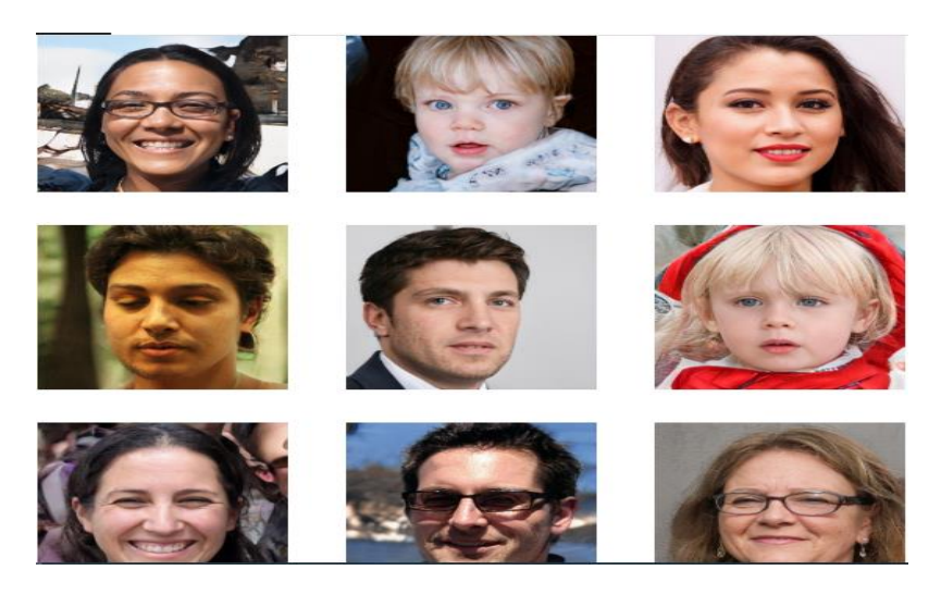
FIGURE 4. - excerpts of the fake images dataset