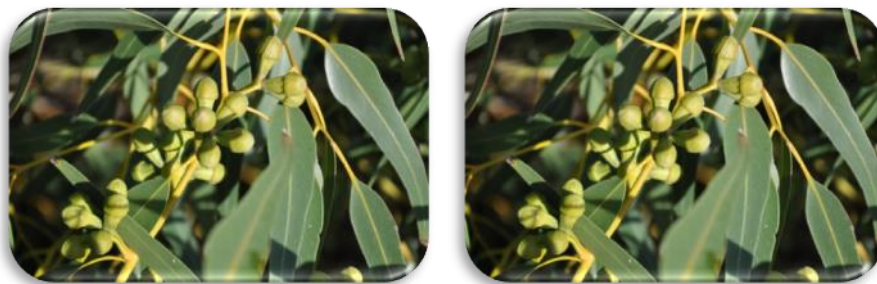
FIGURE 1. - Eucalyptus plants