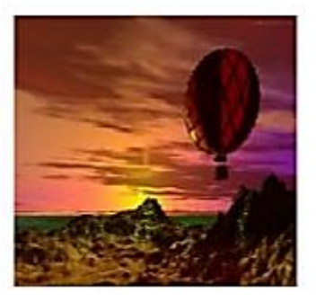
FIGURE 1. - (a) Original image; (b) Embedded image

Steganography is used on a still photograph as an example. The picture on the left is the original cover art, while the image on the right is a stego image created by inserting a text file inside the cover art [17].